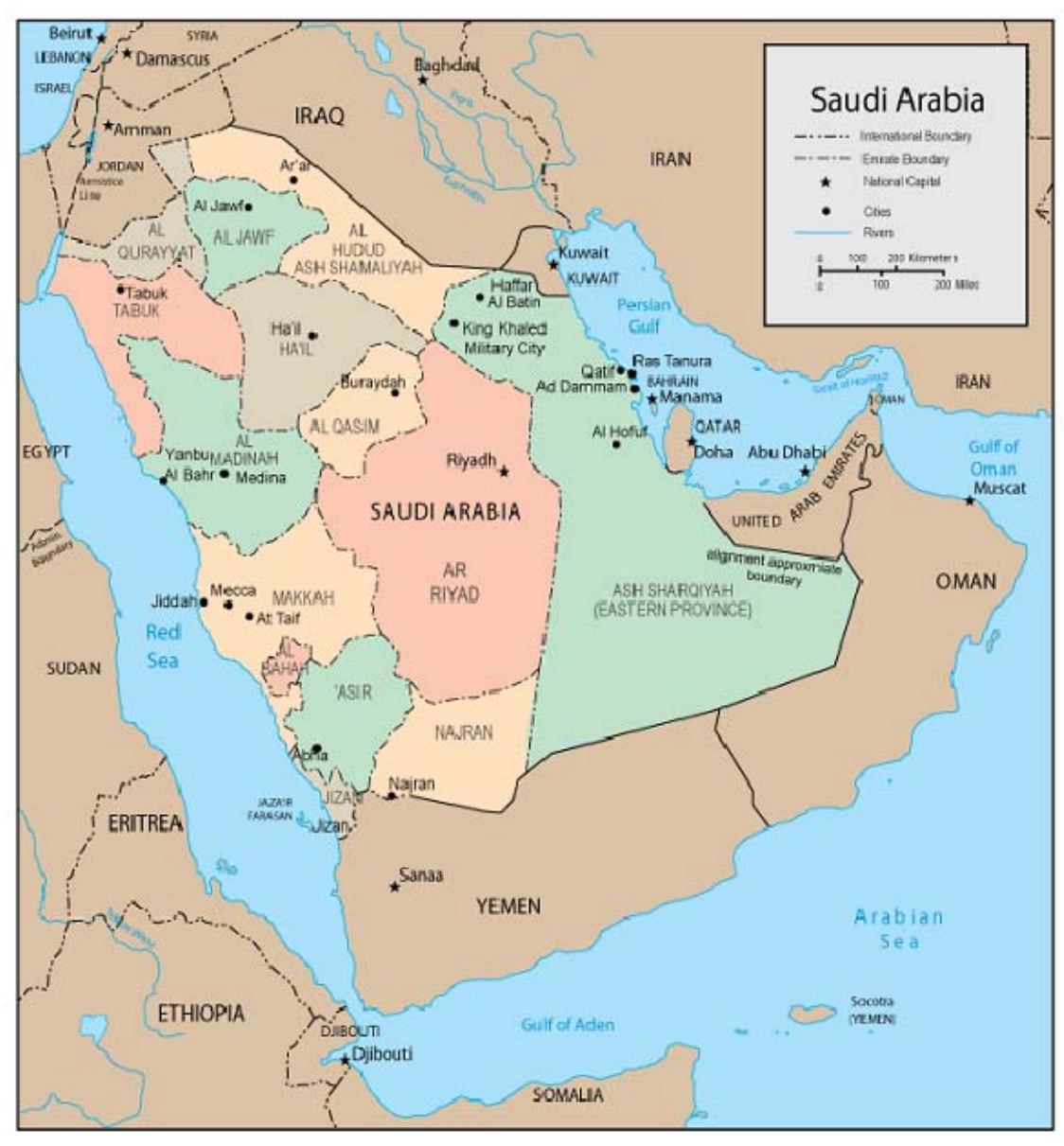
Figure 1. Map of Saudi Arabia